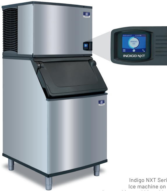
Indigo NXT Series iP0600 Ice machine on D570C bin Ice machine and bin sold separately.

Designed for operators who know that ice is critical to their business, the Manitowoc Indigo NXT Series Ice Machine provides reliable and consistent performance. Built-in preventative diagnostics and programmable operation help minimize downtime and optimize total cost of ownership.